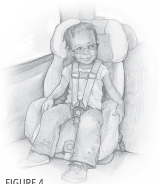
FIGURE 4. Forward-facing-only car safety seat.