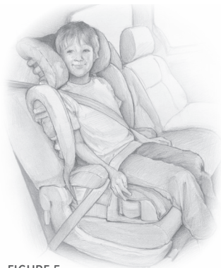
FIGURE 5. Belt-positioning booster seat.