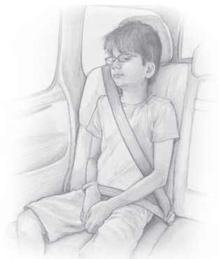
FIGURE 6. Lap and shoulder seat belt.